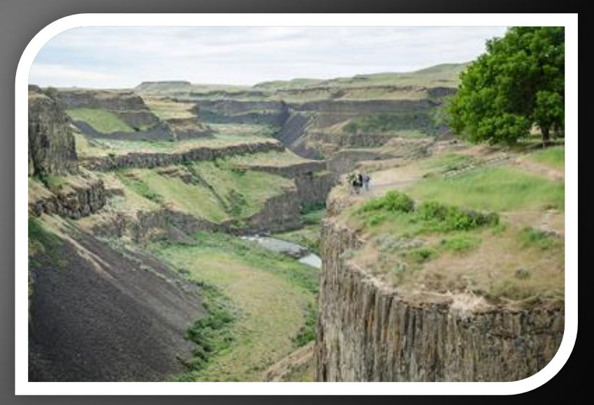
Palouse Falls Overlook