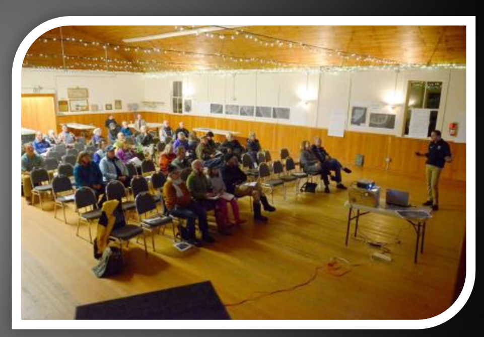
South Whidbey State Park Public Meeting