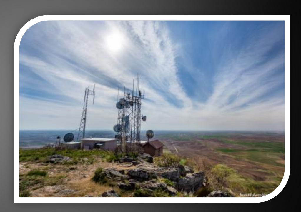
Steptoe Butte State Park