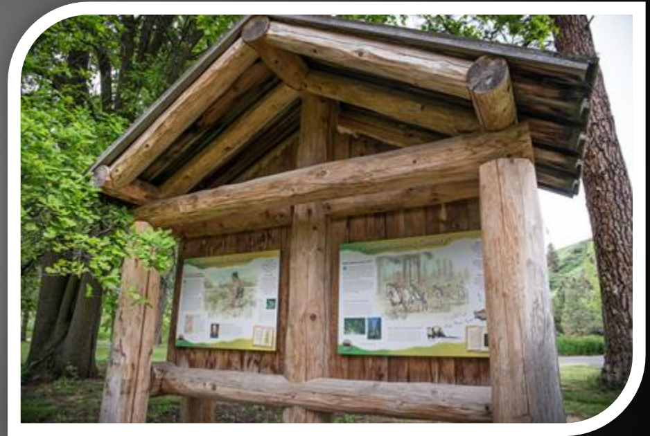
Lewis and Clark Trail Kiosk