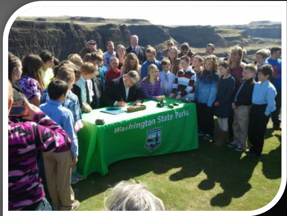
2014 State Waterfall Dedication Governor and Washtucna School students