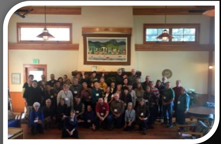
2016 Friends Group Conference, Cama Beach State Park