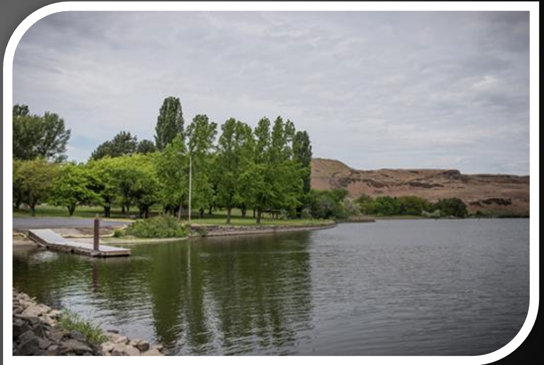
Lyon Ferry State Park