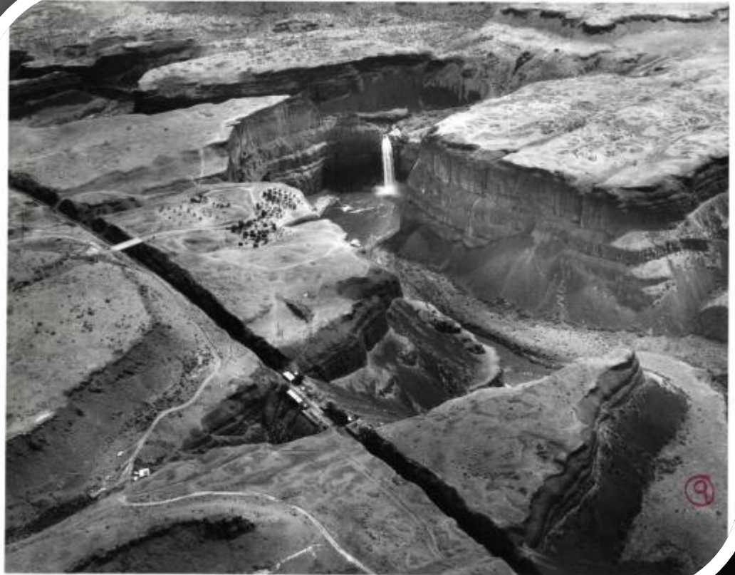
1959 Palouse Falls air photo