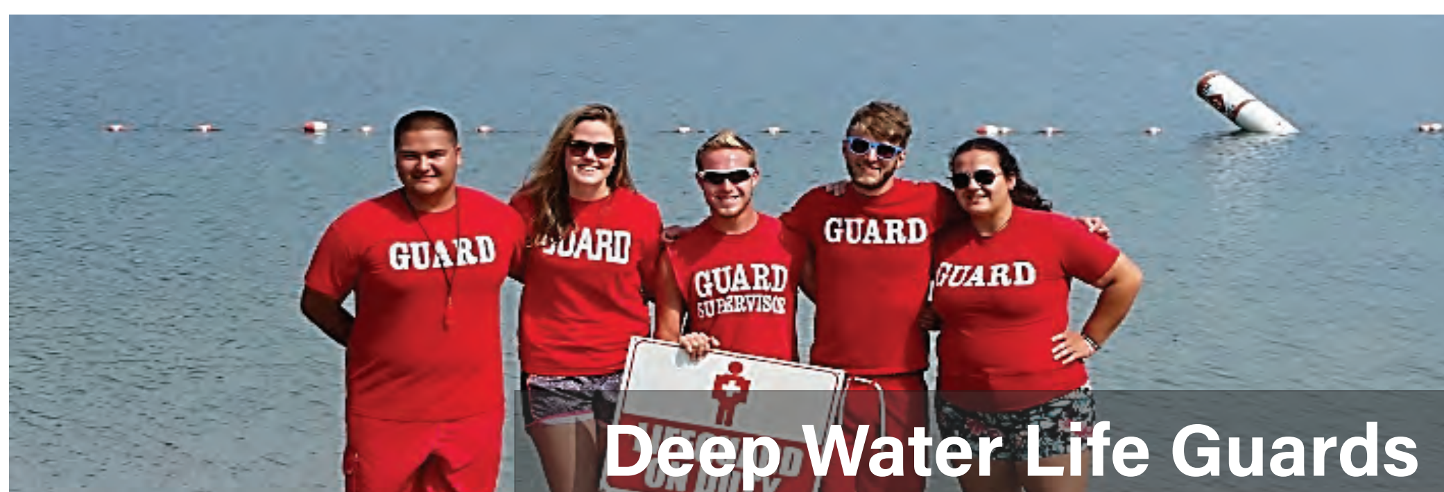
Deep Water Life Guards

The Swim Gym is a supervised offshore floating water park. This allows visitors to have the experience of sliding, diving, swinging, trampolining, and jumping into open water.