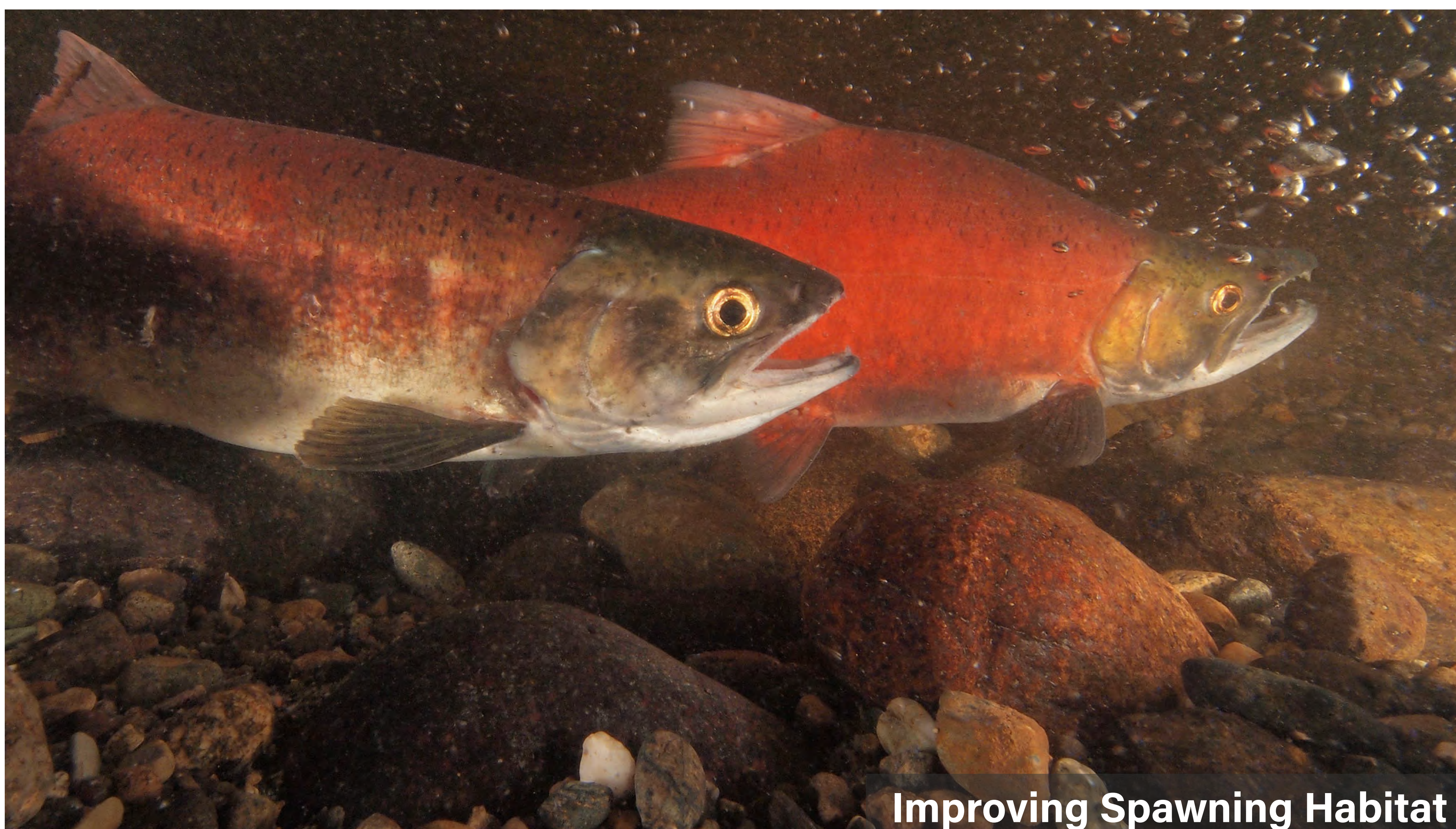
Improving Spawning Habitat