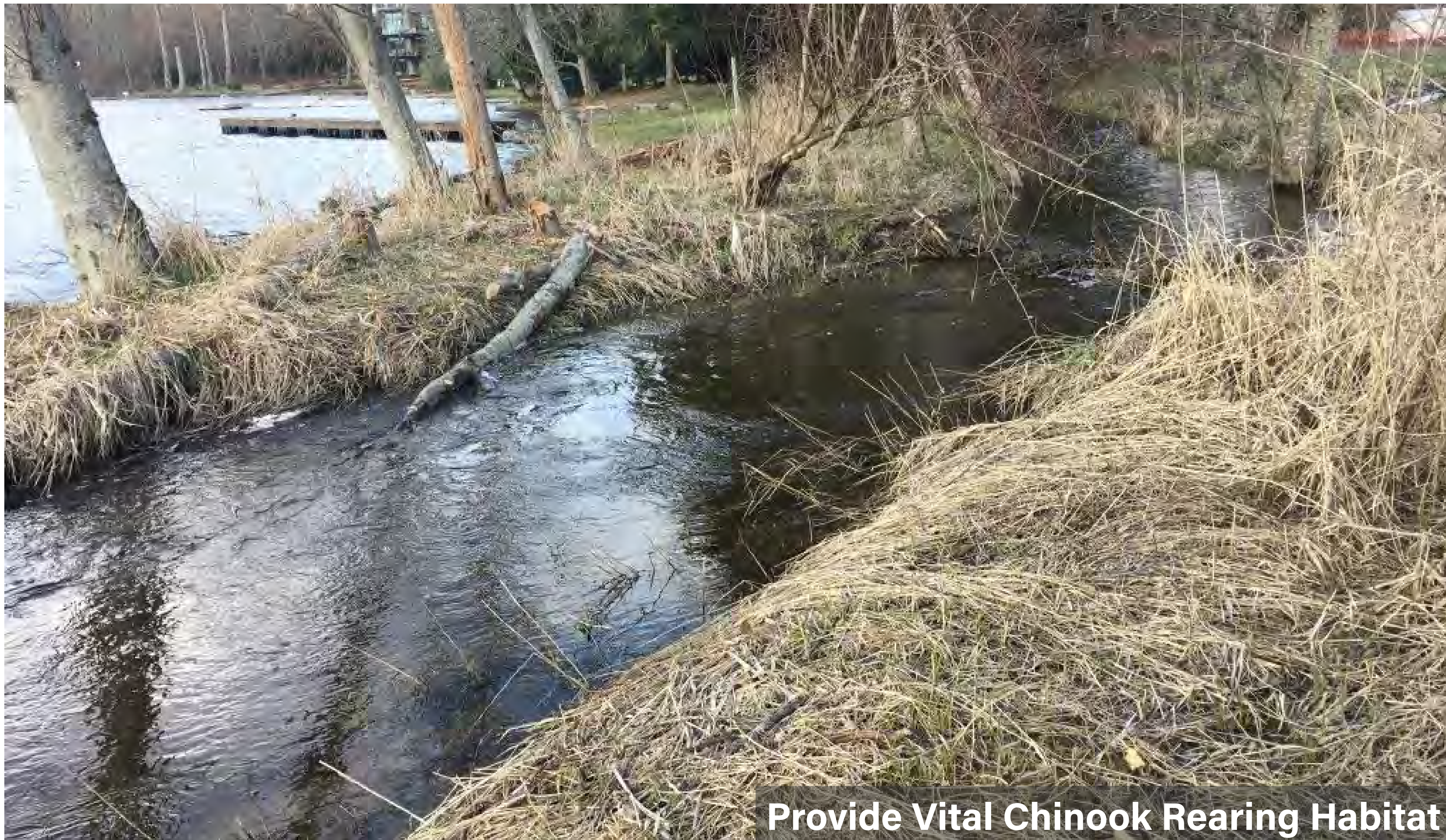
Provide Vital Chinook Rearing Habitat