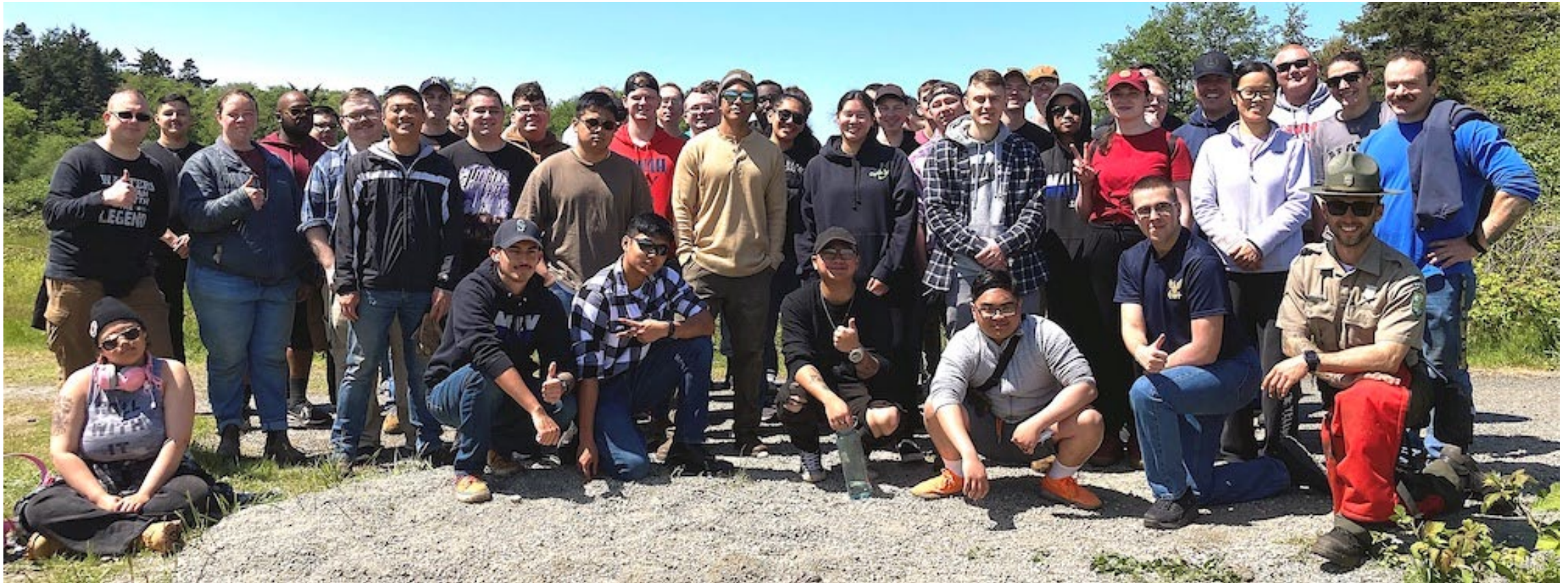
Friends of Whidbey State Parks and Parks staff led volunteer day for 64 Sailors from Naval Air Station Whidbey Island at Joseph Whidbey State Park