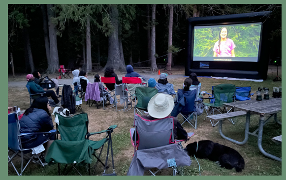
Participants watch Expedition Reclamation.