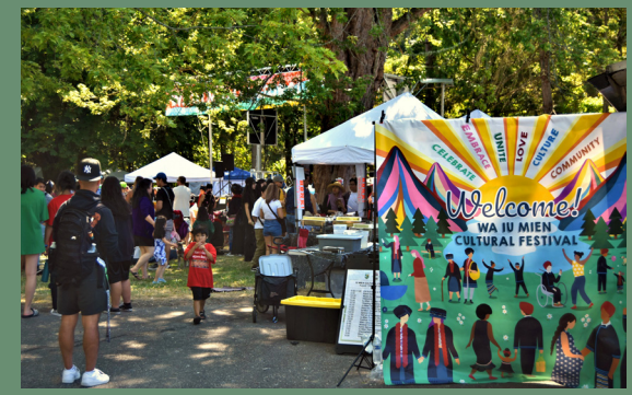
Nearly 2000 participants attended the celebration of lu Mien Festival.