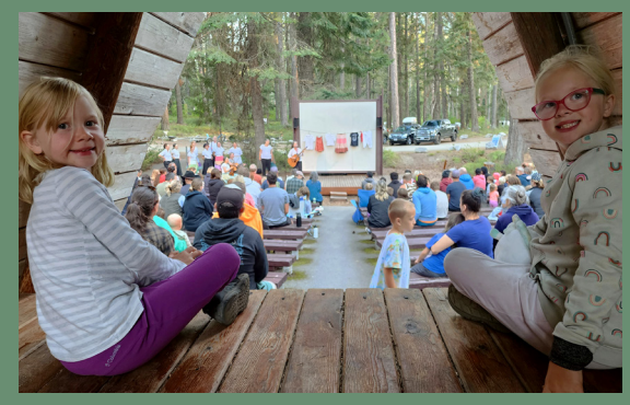
Audience members enjoy a performance by the Eclectic Cloggers.