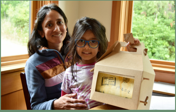
Attendees of Podorythmie's workshop created crankies.