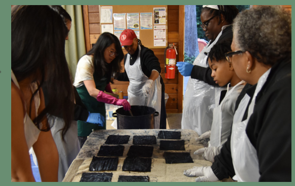
Participants dye their batik pieces in an indigo dye vet.