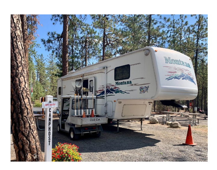
HOST DUTIES: Cleaning campsites, assisting with general park cleanup, assist visitors/campers, working at contact station for check-in/out duties.