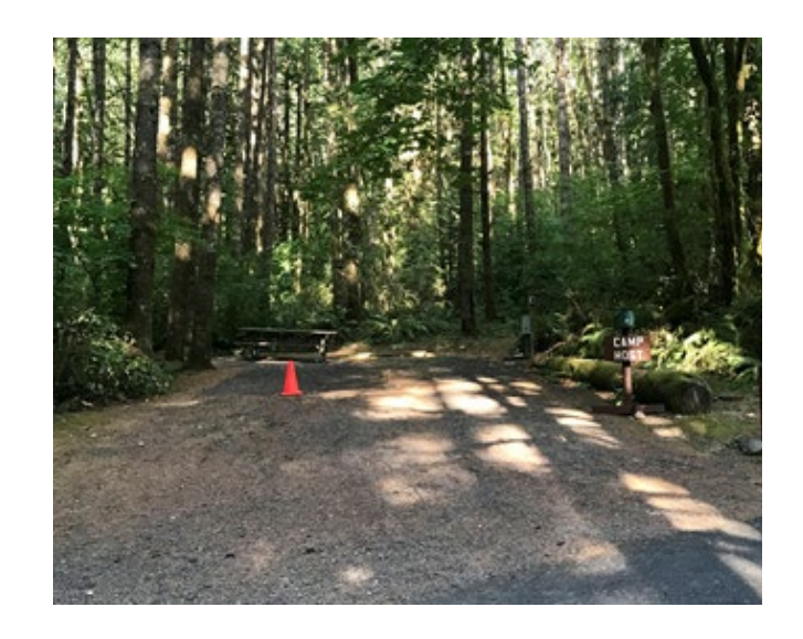
HOST DUTIES: clean campsites, sell firewood, assist visitors, and help out in area of expertise.