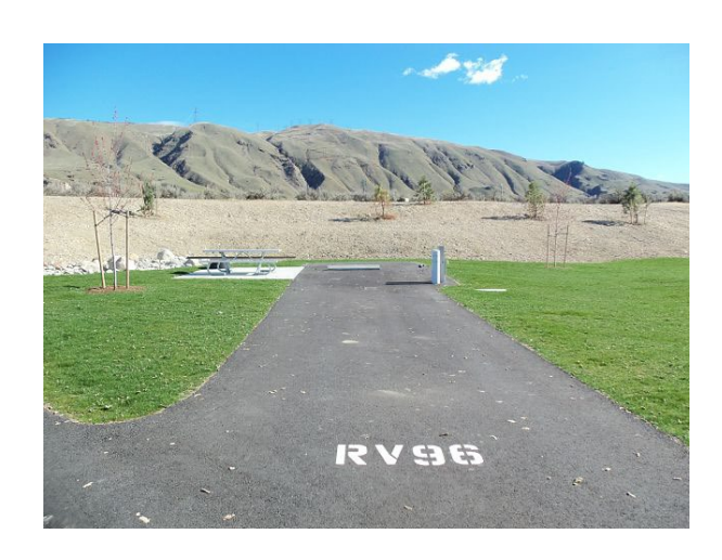
HOST DUTIES: Assist with cleaning of deluxe cabins that include restrooms & showers, weed the designated flower/shrub beds, answer visitor questions.