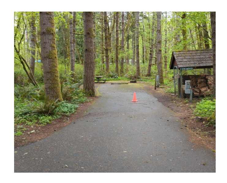
HOST DUTIES: clean campsites, sell firewood, assist visitors, and helps out in their own area of expertise.