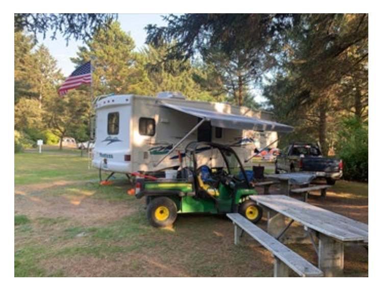
HOST DUTIES: Greet & assist visitors, pick up litter, clean firepits, check restrooms & replenish supplies, clean roadways with blower, check reservation reports daily, attend monthly staff & safety meetings, and attend morning meetings (optional).