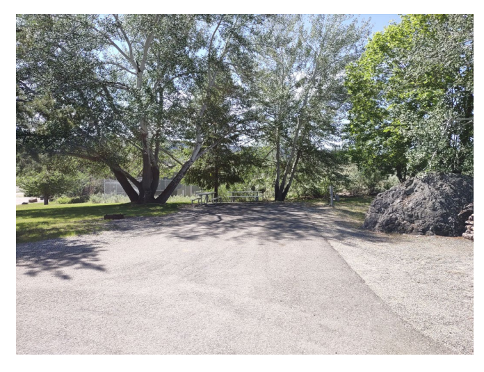
HOST DUTIES: Campsite cleaning, watering lawns, firewood & ice sales, general maintenance, and trash pickup. Also, first line of customer contact when park staff is unavailable

Bridgeport State Park | Washington State Parks and Recreation Commission