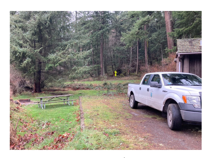
HOST DUTIES: assist with check in/out, help with inventory, and general clean up.