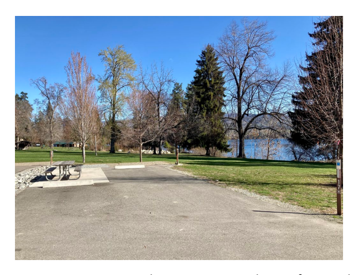
HOST DUTIES: Campsite cleaning, watering lawns, firewood & ice sales, general maintenance, and trash pickup. Also, first line of customer contact when park staff is unavailable.

<u>Lake Chelan State Park | Washington State Parks and Recreation Commission</u>