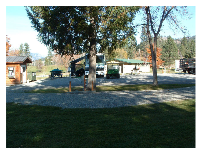
HOST DUTIES: Operate store with wood and ice sales, some mowing, some landscaping, and assisting campers with questions.

<u>Curlew Lake State Park | Washington State Parks and Recreation Commission</u>