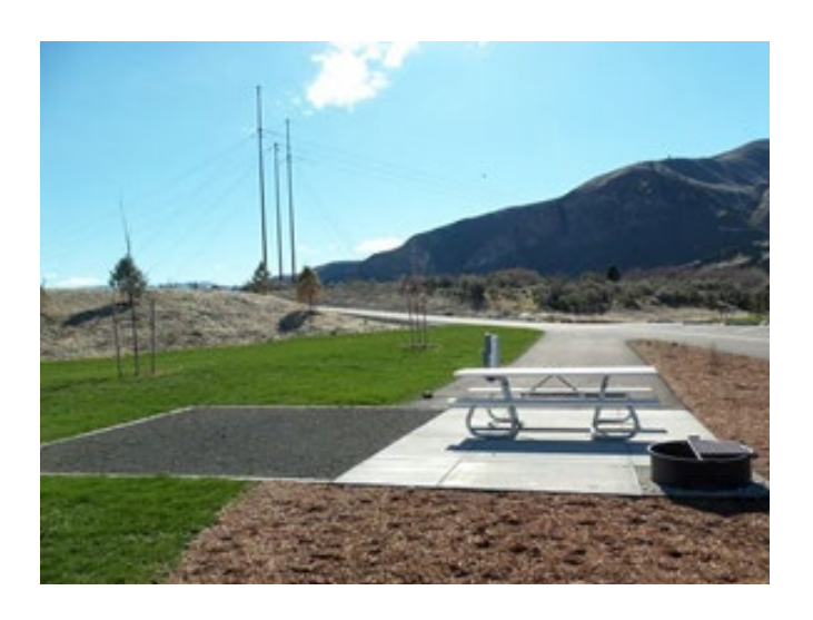
HOST DUTIES: Assist with cleaning of deluxe cabins that include restrooms & showers, weed the designated flower/shrub beds, answer visitor questions.