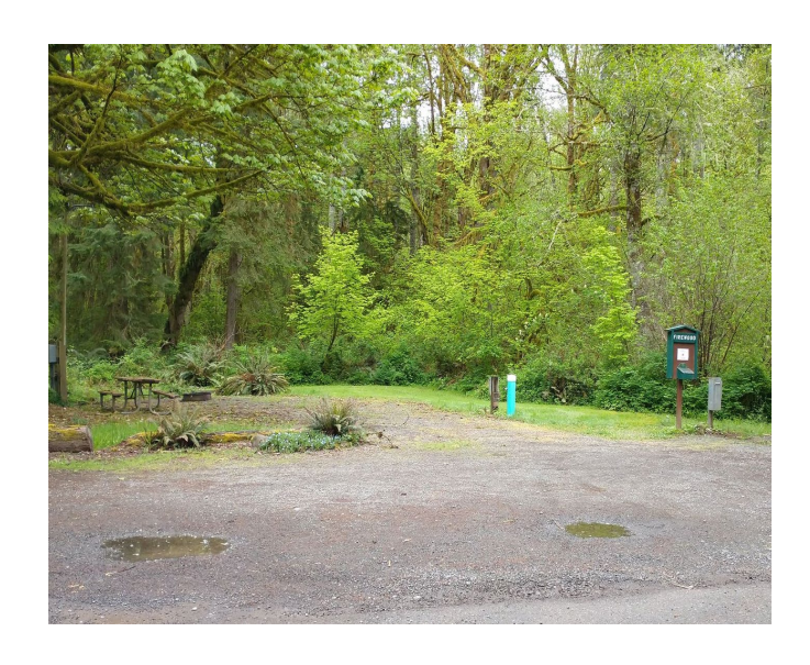
HOST DUTIES: clean campsites, sell firewood, assist visitors, and helps out in their own area of expertise.