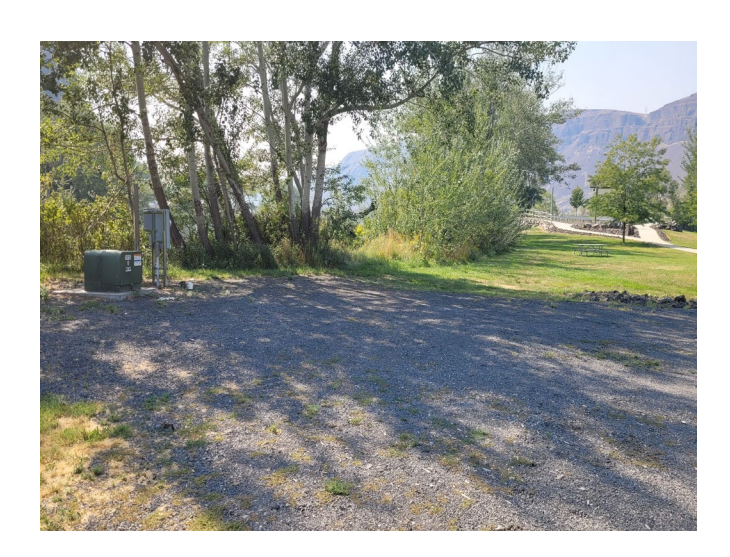
HOST DUTIES: Potential volunteers should have a special interest in working a visitor center, helping kids learn Junior Ranger activities, and very light janitorial/landscaping skills.