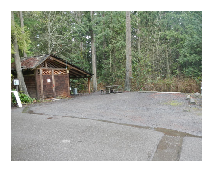
HOST DUTIES: Park staff will have all the details.