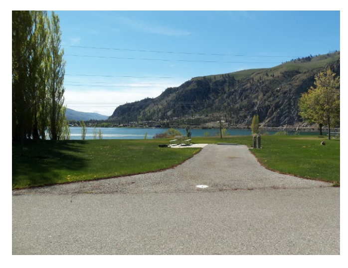
HOST DUTIES: Sell firewood & ice for PIA program, clean campsites, pick up litter, answer visitor questions, small projects if needed.

<u>Daroga State Park | Washington State Parks and Recreation Commission</u>