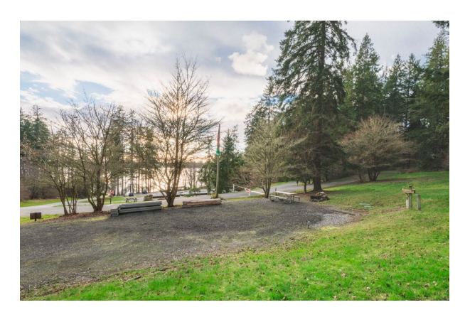
HOST DUTIES: Assist campers/boaters with questions, clean campsites, open/close gates, litter pickup, weed removal. Projects may be available if interested.

Joemma Beach State Park | Washington State Parks and Recreation Commission