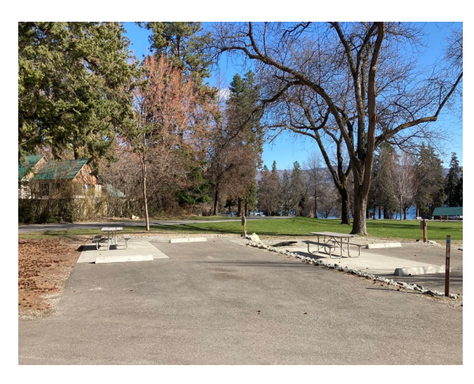
HOST DUTIES: Campsite cleaning, watering lawns, firewood & ice sales, general maintenance, and trash pickup. Also, first line of customer contact when park staff is unavailable.