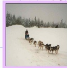
Iron Horse State Park John Wayne Pioneer Trail