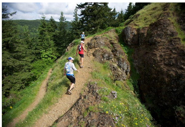
Hamilton Mountain trail.

Alternatively, instead of taking the Equestrian Trail the entire way to The Saddle, take Upper Hardy Trail .74 miles, then take Don's Cutoff Trail through a beautiful dark section of forest re-joining the Equestrian Trail in a little over a half mile, from here it is in less than a quarter mile to The Saddle.